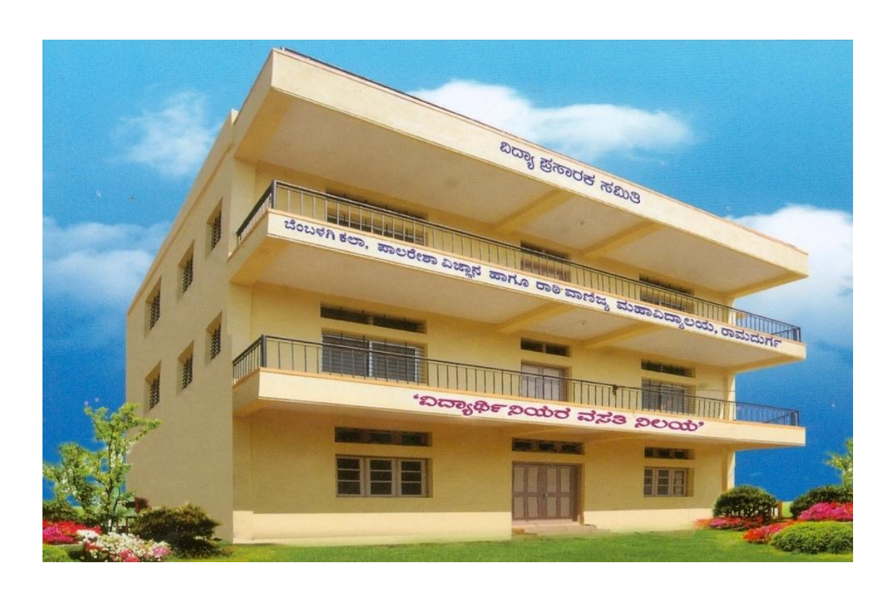
College Ladies Hostel