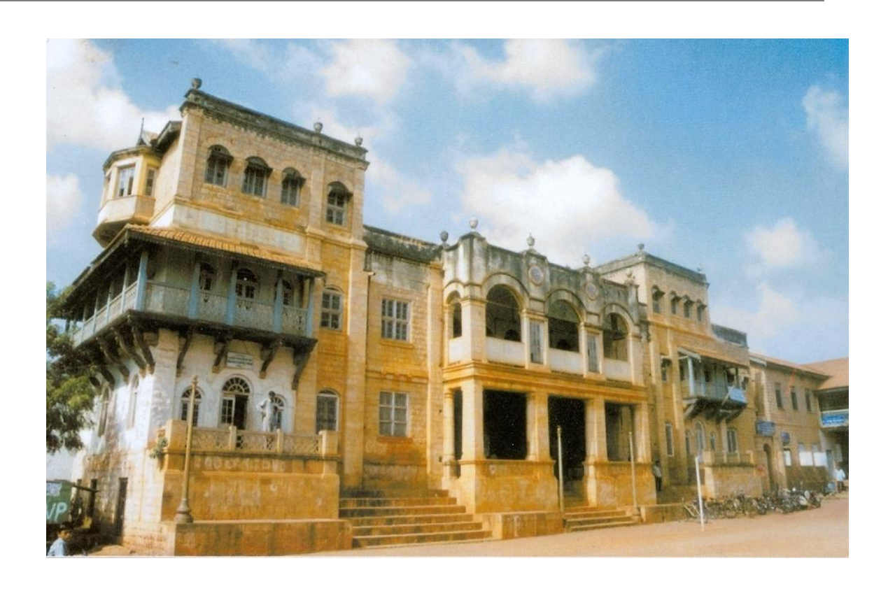
College Building: Royal Palace