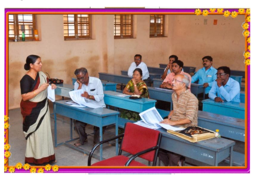
AAA Committee interaction