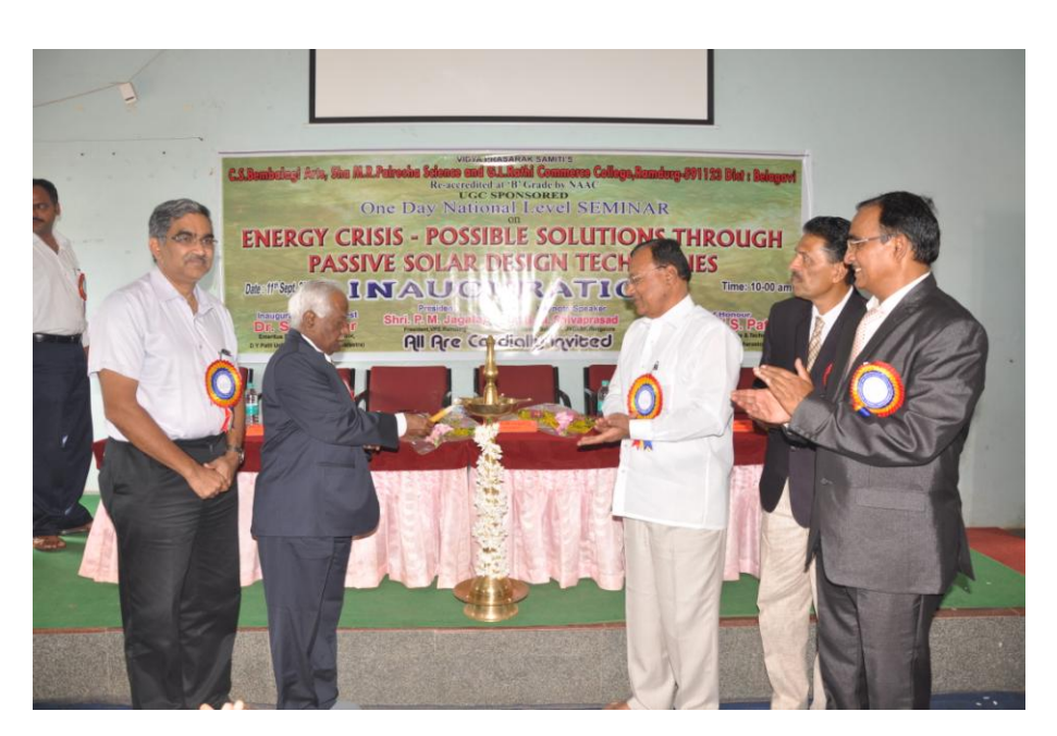
Inaugural Session of UGC Sponsored National Level Seminar in Physics