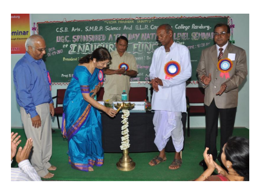
Inaugural Session of UGC Sponsored National Level Seminar in English